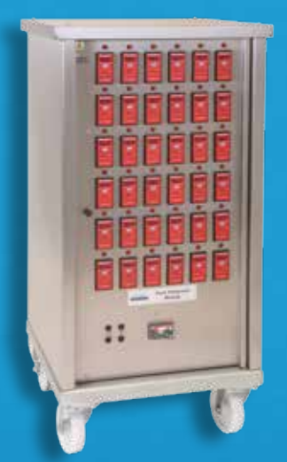
36 Channel Unit